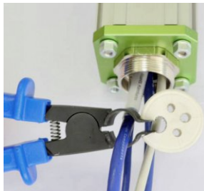
The Spreading Pliers are helpful to insert cables into the cable gland insert