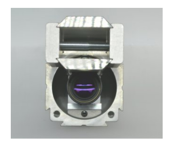
The Alignment-Tool makes a straight camera integration easier