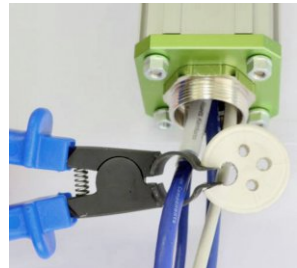
The Spreading Pliers are helpful to insert clables into the cable gland insert