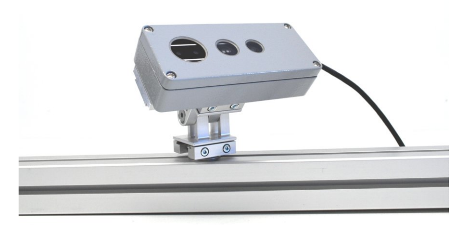
The enclosures adapt to all Mounting Kits